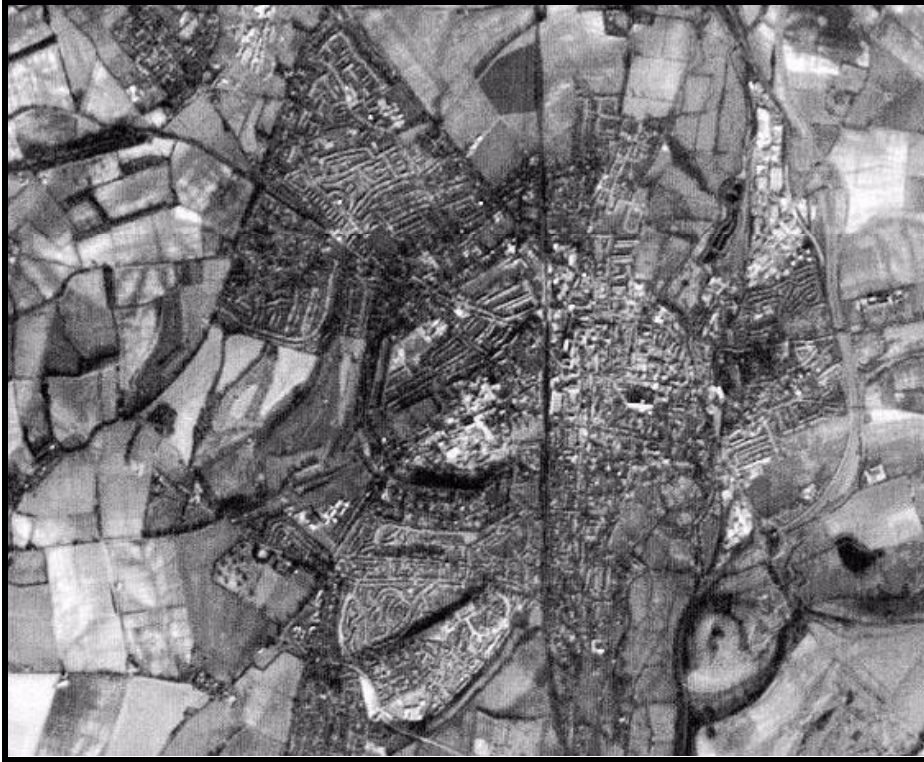
SPOT satellite image